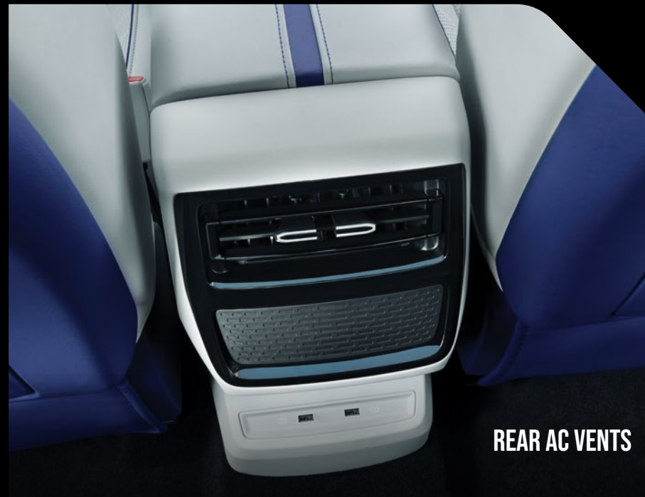
REAR AC VENTS

The MG Whale is equipped with cutting-edge technology and is developed with a human-centric design in mind. Featuring a dual 12.3-inch curved panoramic screen and a button-free design, the MG Whale connects you at every level of the latest in cutting-edge technology, including wireless charging, Apple and Android connection, a high-fidelity upto 9 speaker surround sound system, and infotainment screens features the latest technology.