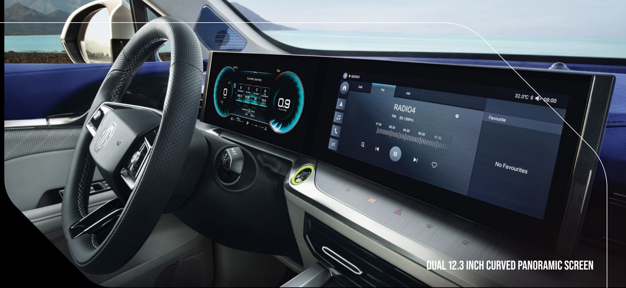
DUAL 12.3 INCH CURVED PANORAMIC SCREEN