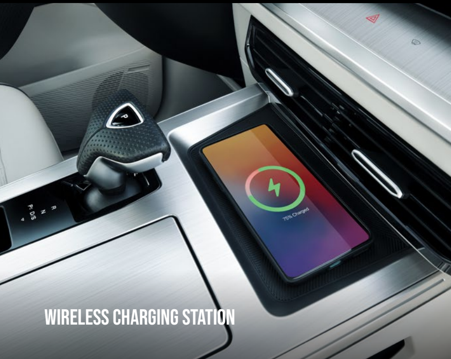
WIRELESS CHARGING STATION