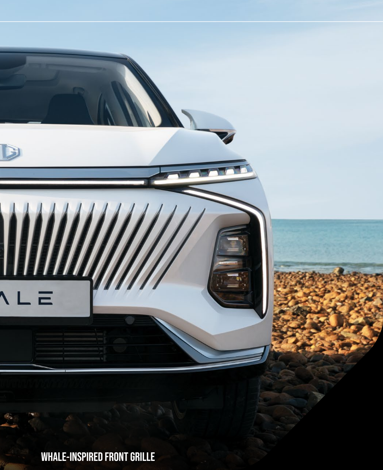
WHALE-INSPIRED FRONT GRILLE