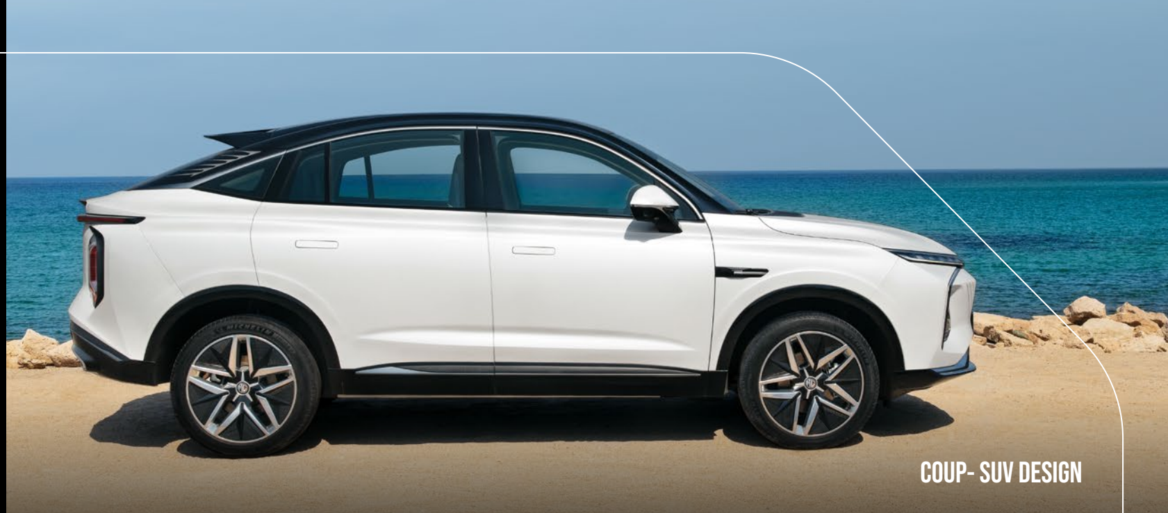
COUP- SUV DESIGN