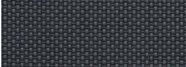
Tic Toc in Generic Silver seat facing Mondus in Ebony seat sides