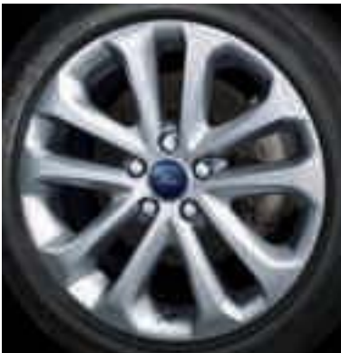
17" multi-spoke 'machined' finish alloy wheel (Optional on Titanium) Also available as an accessory