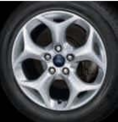
16" 5-spoke alloy wheel (Standard on Zetec) Also available as an accessory