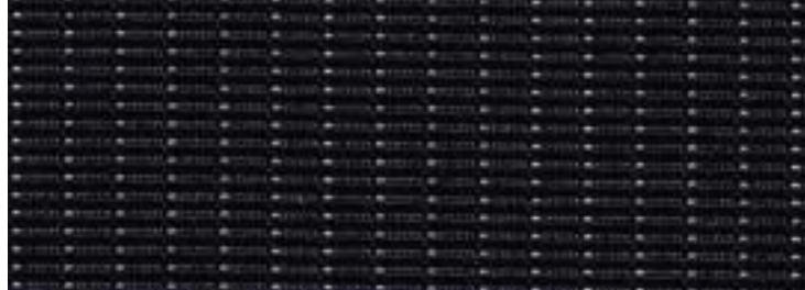
New York in Ebony seat facing Lux in Ebony seat sides