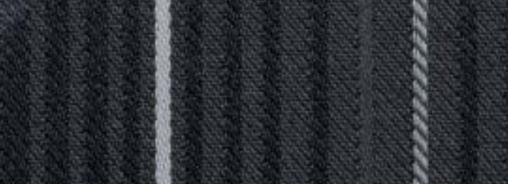
Ecrin in Generic Silver seat facing Mondus in Ebony seat sides