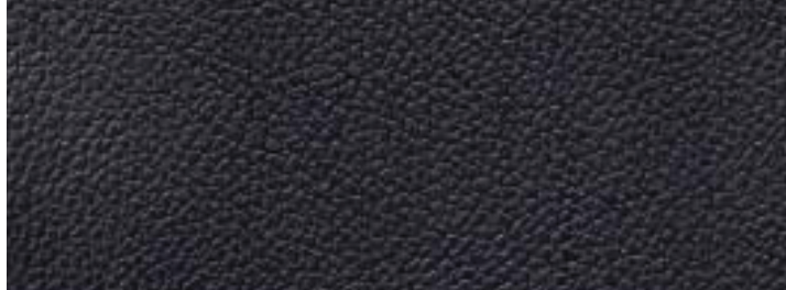
Napoli leather in Ebony seat facing and seat sides*