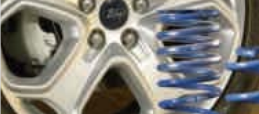
Eibach suspension-lowering kit Enhances driving performance and handling as well as giving a more sporty appearance, lowering the car by approximately 30 mm. (Accessory)

A powerful grip and distinctive looks go hand in hand with our range of stylish alloy wheels, each designed to perfectly complement the dynamic lines of your new Ford Focus.