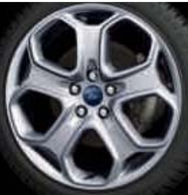
18" 7-spoke 'anthracite' alloy wheel with 'machined' rim (Accessory)