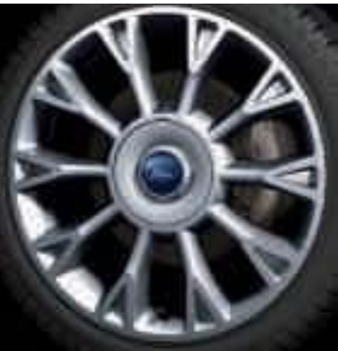
18" RS alloy wheel in Silver. Also available in White, Panther Black and Black Machined (Accessory)