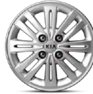
14-inch Alloy Wheel