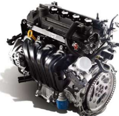
1.4 MPI Gasoline Engine Max. power: 95 ps / 6,000 rpm Max. torque: 13.5 kg-m / 4,000 rpm