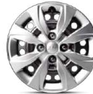
14-inch Steel Wheel