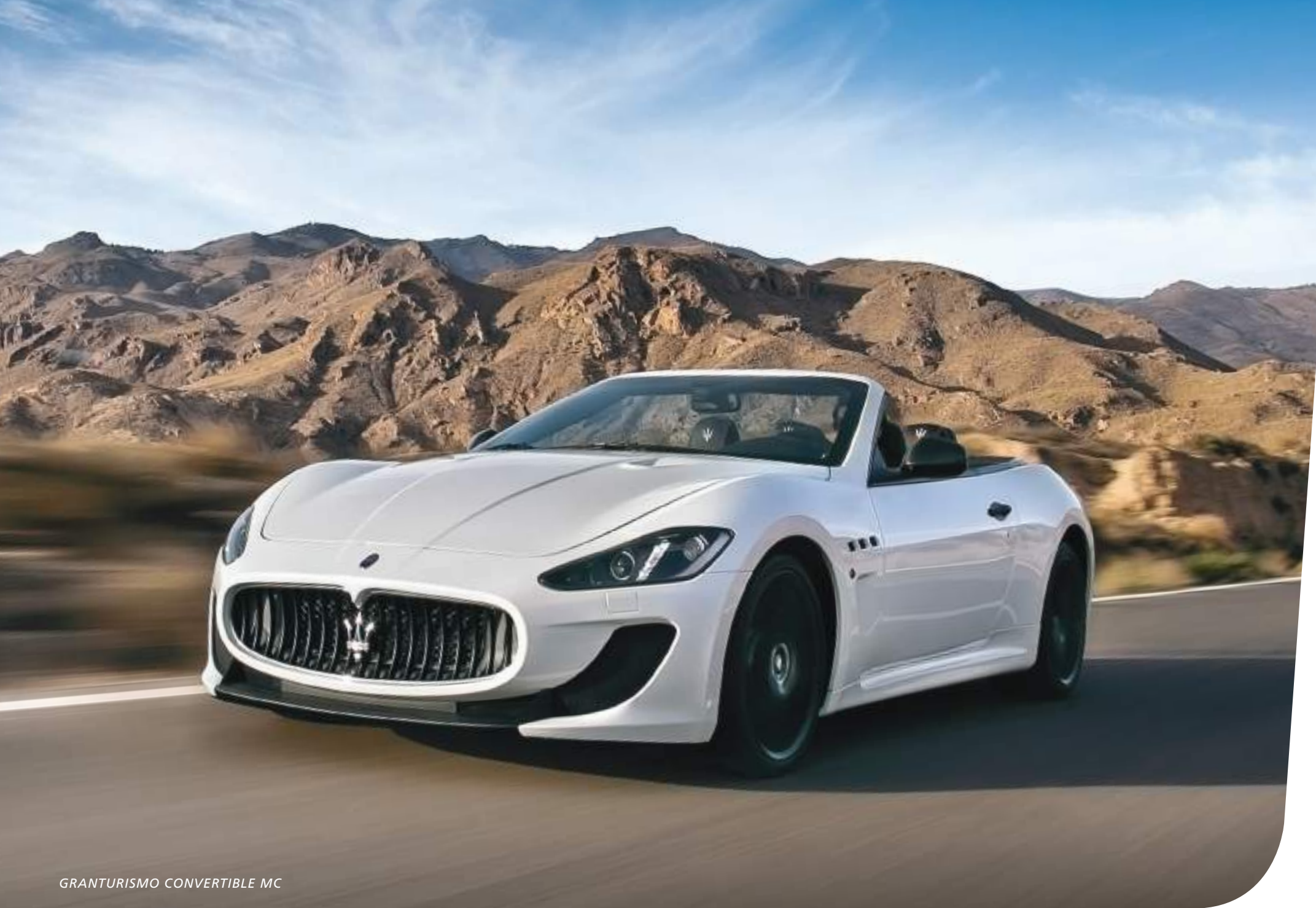
GRANTURISMO CONVERTIBLE MC