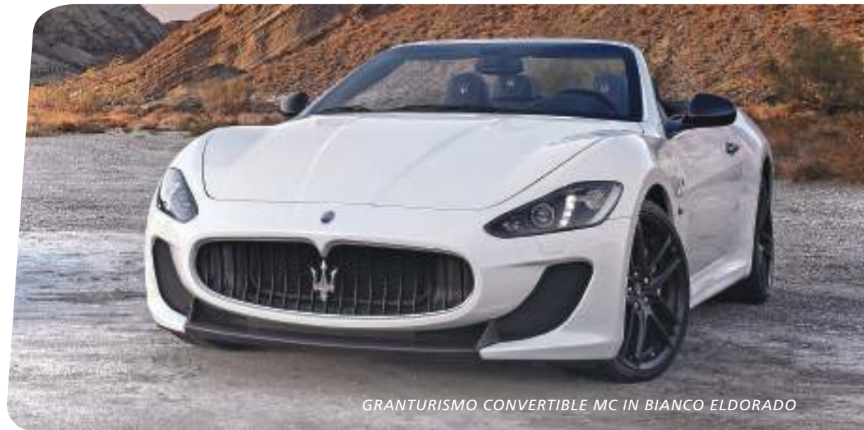
GRANTURISMO CONVERTIBLE MC IN BIANCO ELDORADO