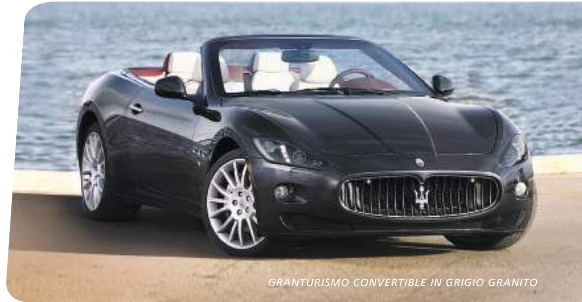
GRANTURISMO CONVERTIBLE IN GRIGIO GRANITO

The exclusive Maserati GranTurismo Convertible MC takes style and purpose-built performance to the extreme. Inspired by the Maserati Corse racing department, it is the ultimate convertible GranTurismo; its creation owes much to Maserati's successful Trofeo racing series.