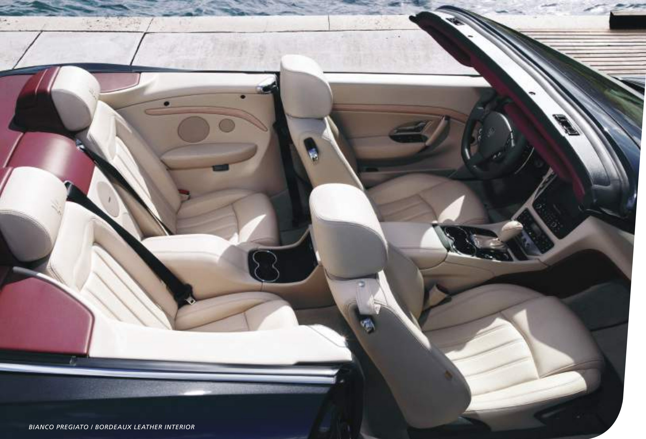
BIANCO PREGIATO / BORDEAUX LEATHER INTERIOR