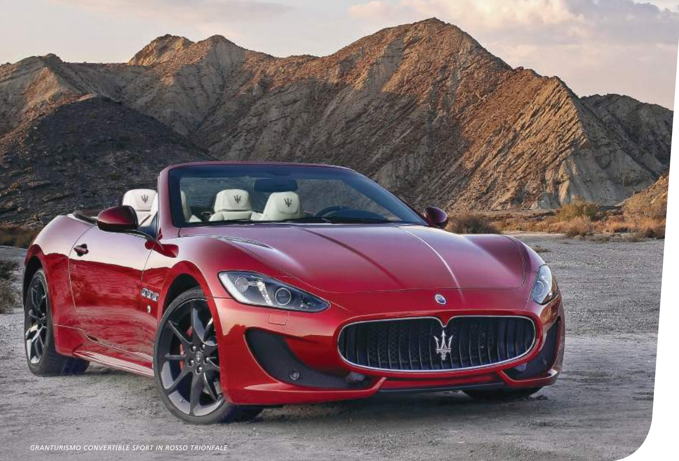
GRANTURISMO CONVERTIBLE SPORT IN ROSSO TRIONFALE