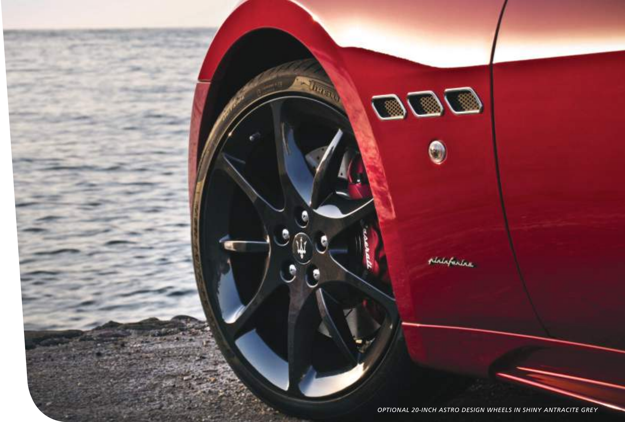
OPTIONAL 20-INCH ASTRO DESIGN WHEELS IN SHINY ANTRACITE GREY