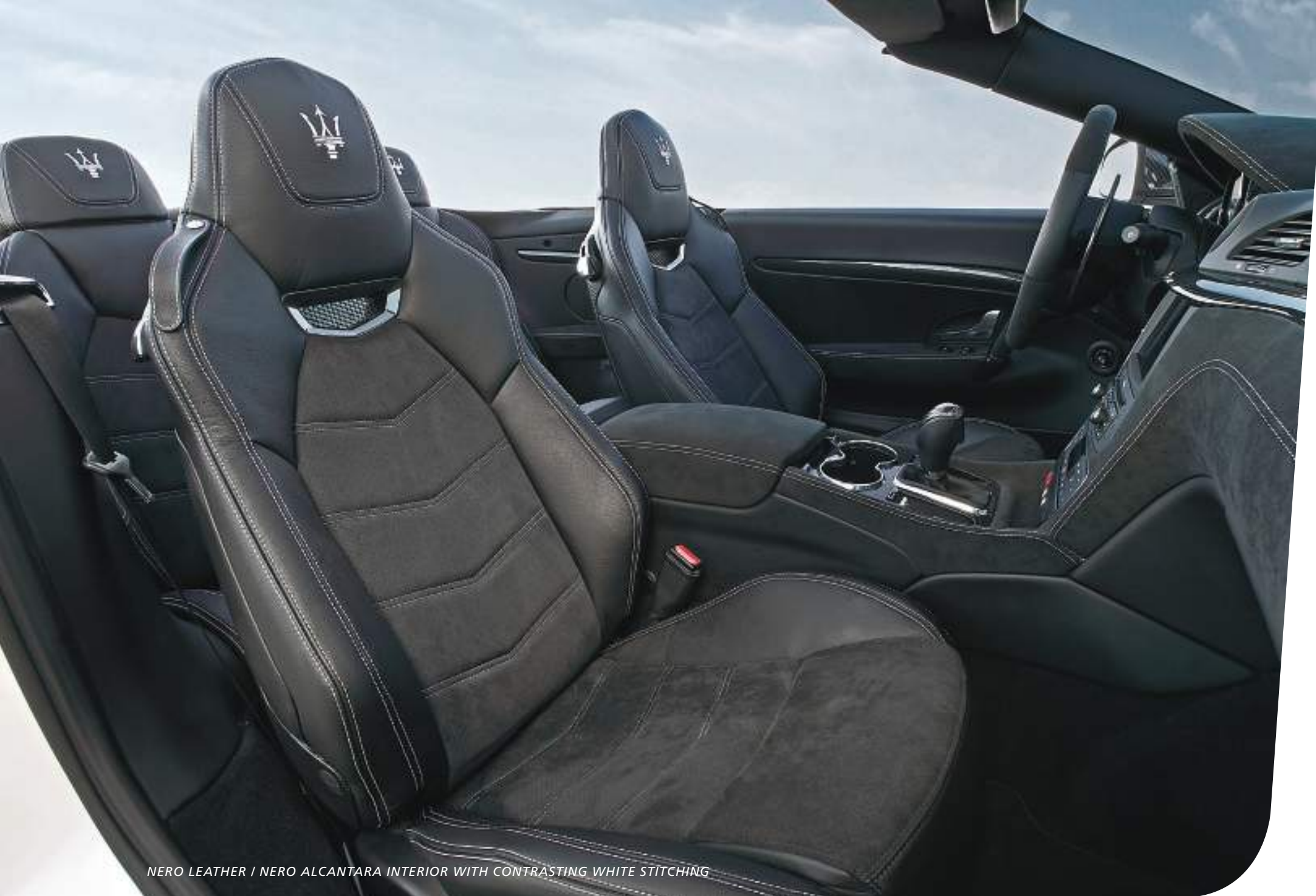
NERO LEATHER / NERO ALCANTARA INTERIOR WITH CONTRASTING WHITE STITCHING