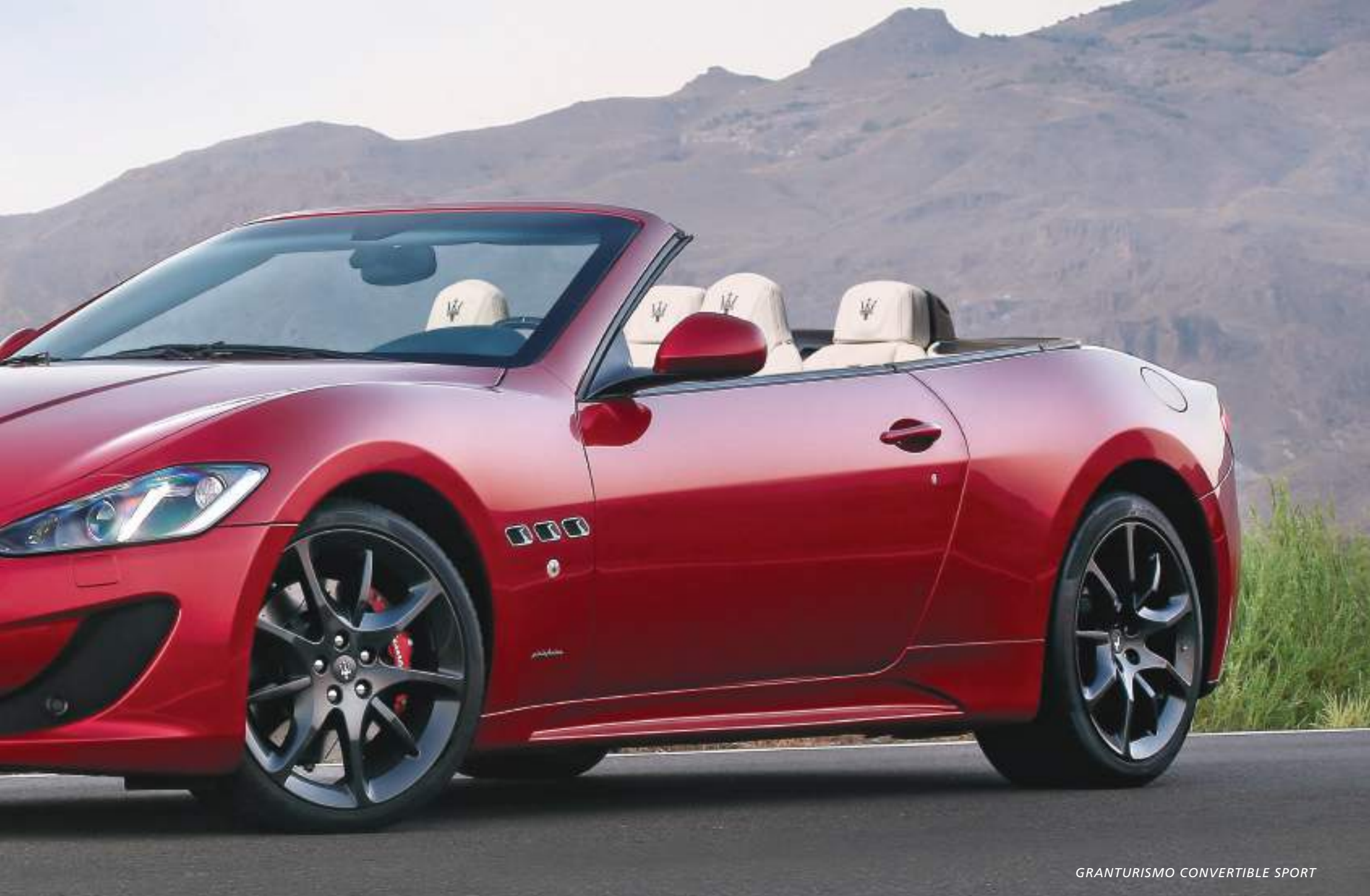
GRANTURISMO CONVERTIBLE SPORT